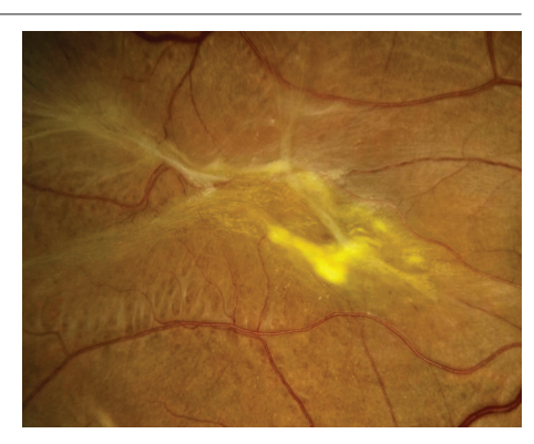
Figure 2 Epiretinal Membrane

There are no eye drops, medications or nutritional supplements to treat ERMs. A surgical procedure called vitrectomy is the only option in eyes that require treatment. With vitrectomy, small incisions are placed in the white