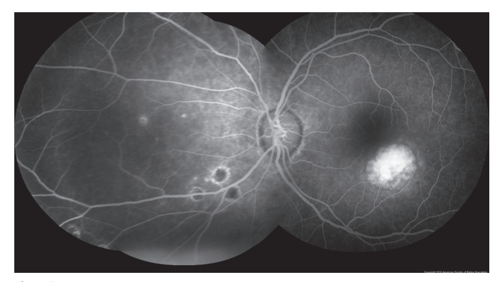
Figure 2 John S. King, MD. Presumed Ocular Histoplasmosis Syndrome. Retina Image Bank 2012; Image 421. © the American Society of Retina Specialists.

Treatment and Prognosis: Treatment is generally required only when there is neovascularization. Given that H. capsulatum does not seem to play a direct role in the development of POHS, antifungal agents are not used to treat POHS. However, injections of medications that inhibit neovascularization are recommended. These medications include bevacizumab (Avastin*), ranibizumab (Lucentis*) and aflibercept (Eylea*).