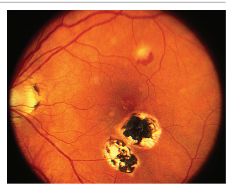
Figure 1 Color fundus photograph of the right eye of a patient with POHS shows typical punched out scars and peripapillary atrophy.

Consequently, it is thought that H. capsulatum enters the eye from the bloodstream, invading the choroidal vessels and ultimately